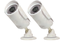
M916SM2+2*C708DB6 White or Black optional